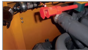
Fire Fighting System