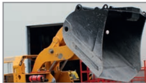
Z -Kkinematics for High Breaking Force